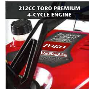
212CC TORO PREMIUM 4-CYCLE ENGINE

Commercial variable speed transmission allows you to shift on the fly with 6 forward and 2 reverse speeds.