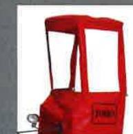
SNOW CAB KIT Part #116-8227