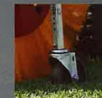
TURF CASTER Part #116-8228