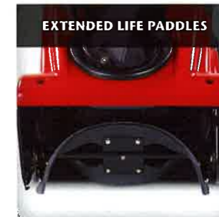
EXTENDED LIFE PADDLES

Less operator fatigue and more control – reflective for increased visibility.