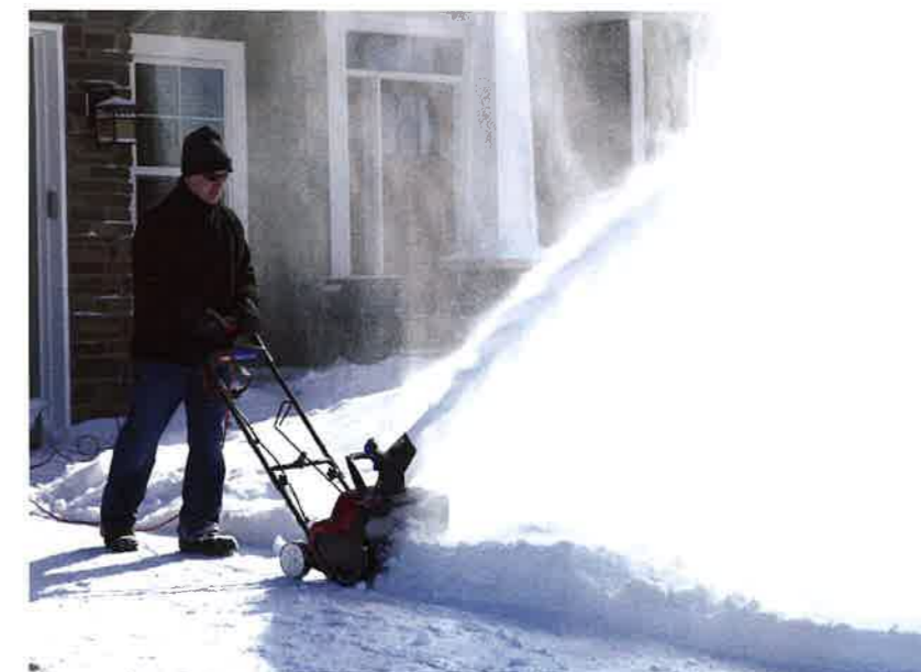
1800 POWER CURVE