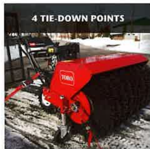
4 TIE-DOWN POINTS

Fasten your product quickly and firmly with our structurally sound integrated tie-down points for safe and easy transportation.