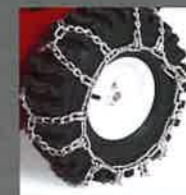
TIRE CHAIN KIT Part #107-3813