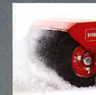
CONCRETE/SNOW BRISTLE DISCS Part #116-8232