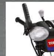
LIGHT KIT Part #116-8234