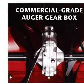
COMMERCIAL-GRADE AUGER GEAR BOX

Effortless maneuverability with the pull of a trigger.