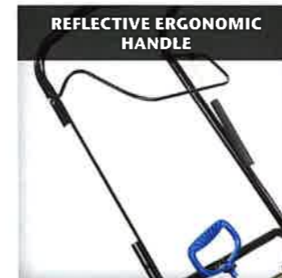
REFLECTIVE ERGONOMIC HANDLE

More power to complete tough jobs quickly.