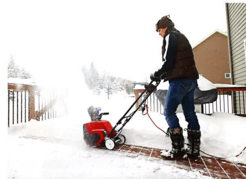
1500 POWER CURVE