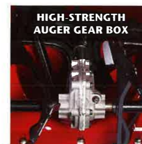
HIGH-STRENGTH AUGER GEAR BOX

Blizzard in the forecast? No worries. Toro Power Max two-stage snowblowers are made for the toughest conditions. With durable components and a patented Anti-Clogging System (ACS), they make quick work of hard, compacted snow. They're also compact and easy to handle. It's the perfect mix of Toro dependability and snow-clearing muscle for longer driveways and heavier snowfalls.