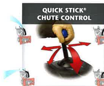
QUICK STICK® CHUTE CONTROL

Chute, deflector and ACS are made of a special cold-weather material durable to -104° F and guaranteed for life. It is also rust-free, so there's no binding, and snow and ice won't stick.