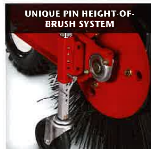
UNIQUE PIN HEIGHT-OF-BRUSH SYSTEM

Fasten your product quickly and firmly with our structurally sound integrated tie-down points for safe and easy transportation.