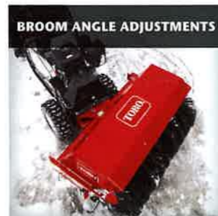
BROOM ANGLE ADJUSTMENTS

Precision height adjustment with up to 1/8" adjustments to minimize surface damage and brush wear.