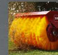
TURF BRISTLE DISCS Part #116-8233