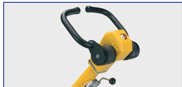
Vibration-dampened guide handle.